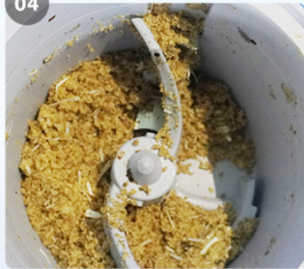
Drying and deodorizing