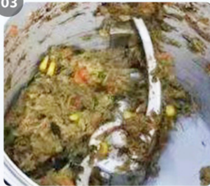
High efficiency dehydration